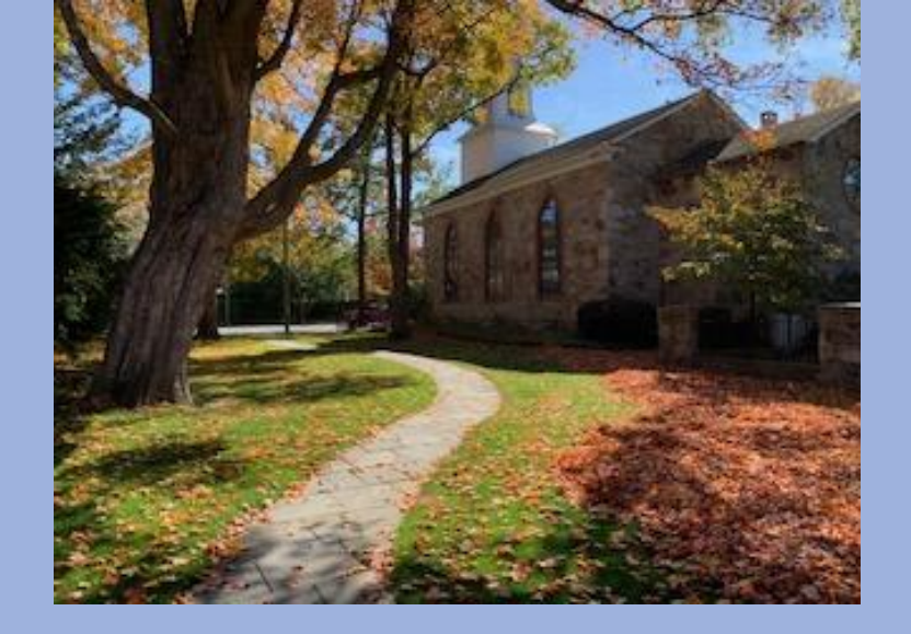
TOMORROW, SATURDAY, 31 OCTOBER 9:00 a.m. – 12:30 p.m. (come as long ... or as short ... as you'd like)

Please bring rakes, tarps, bags, etc. to help clean up the fallen leaves and enjoy some good times with parishioners in a casual, outdoor, masked setting.