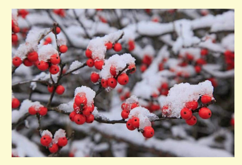
The Fourth Sunday after the Epiphany

www.standrewskentct.org * 860.927.3486 *saintandrewskent@gmail.com