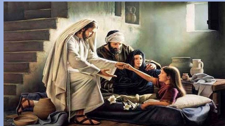
Jesus Raises Jairus' Daughter

www.standrewskentct.org * 860.927.3486 * st.andrew.kent@snet.net