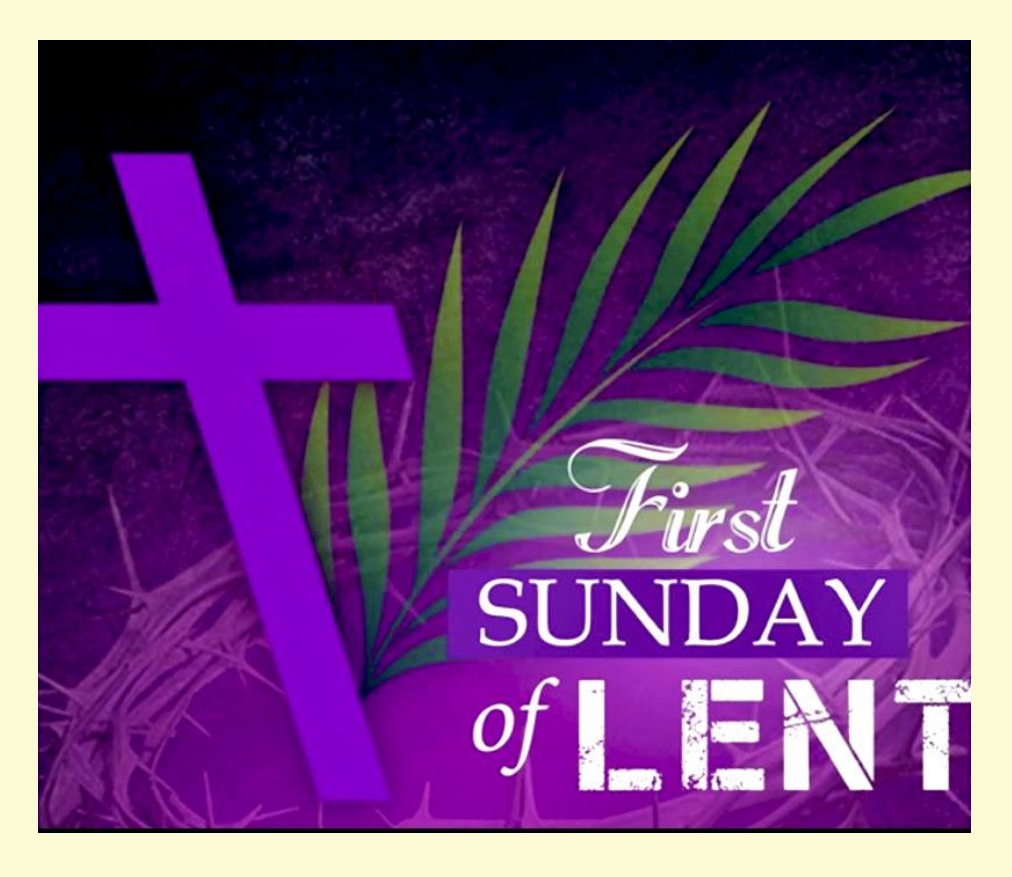
The First Sunday in Lent

www.standrewskentct.org * 860.927.3486 *saintandrewskent@gmail.com