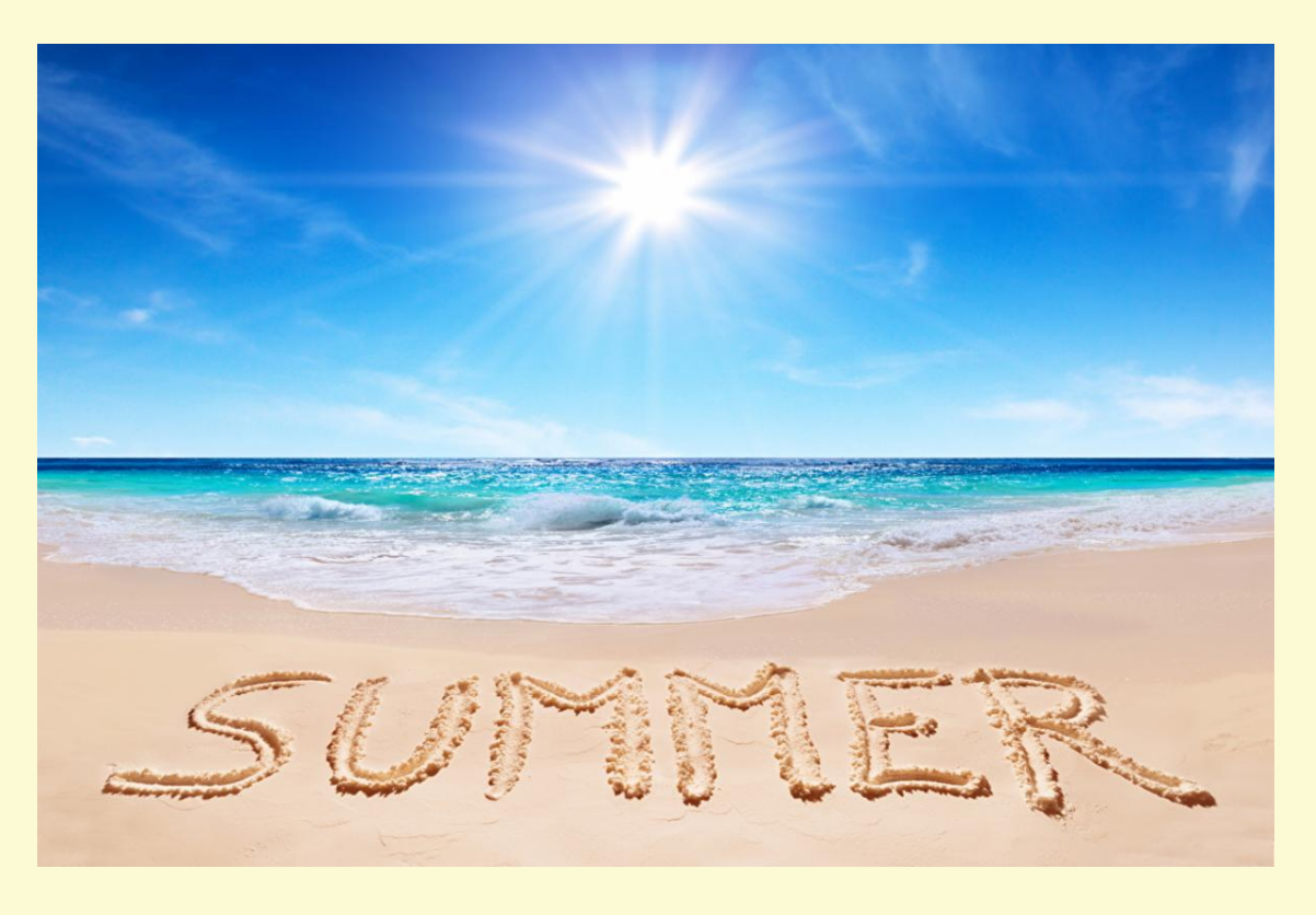
The Fourth Sunday after Pentecost

www.standrewskentct.org * 860.927.3486 *saintandrewskent@gmail.com