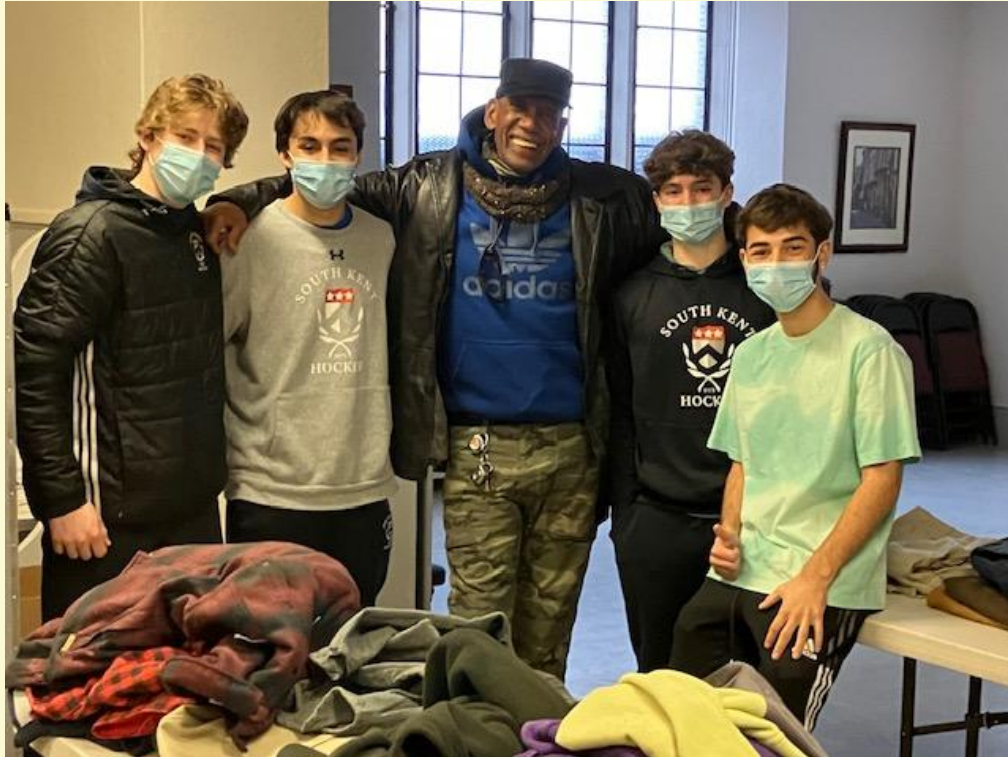
Four South Kent School boys on Sunday, January 28, with a happy Hartford resident at cathedral soup kitchen and clothing boutique.