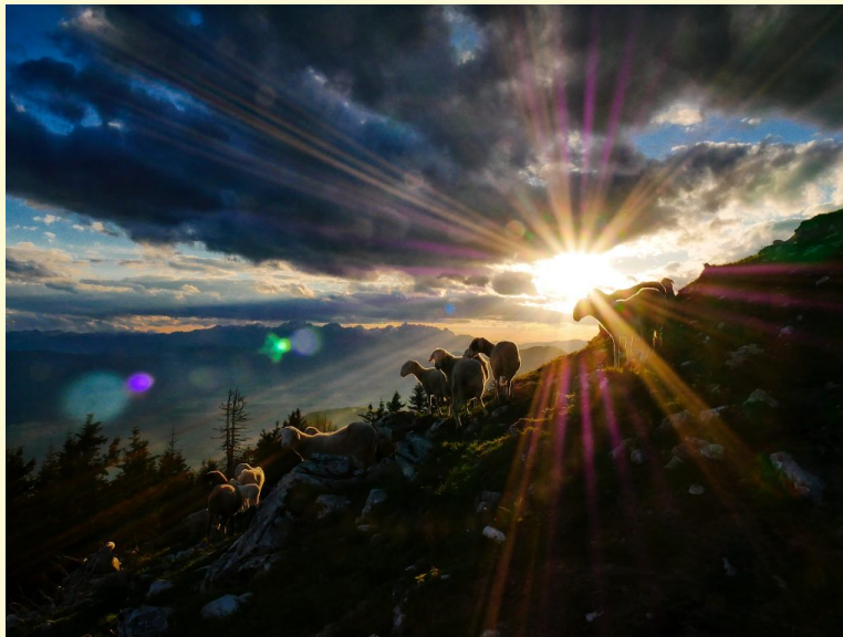
The Eve of the Nativity of Our Lord Jesus Christ

www.standrewskentct.org * 860.927.3486 * saintandrewskent@gmail.com