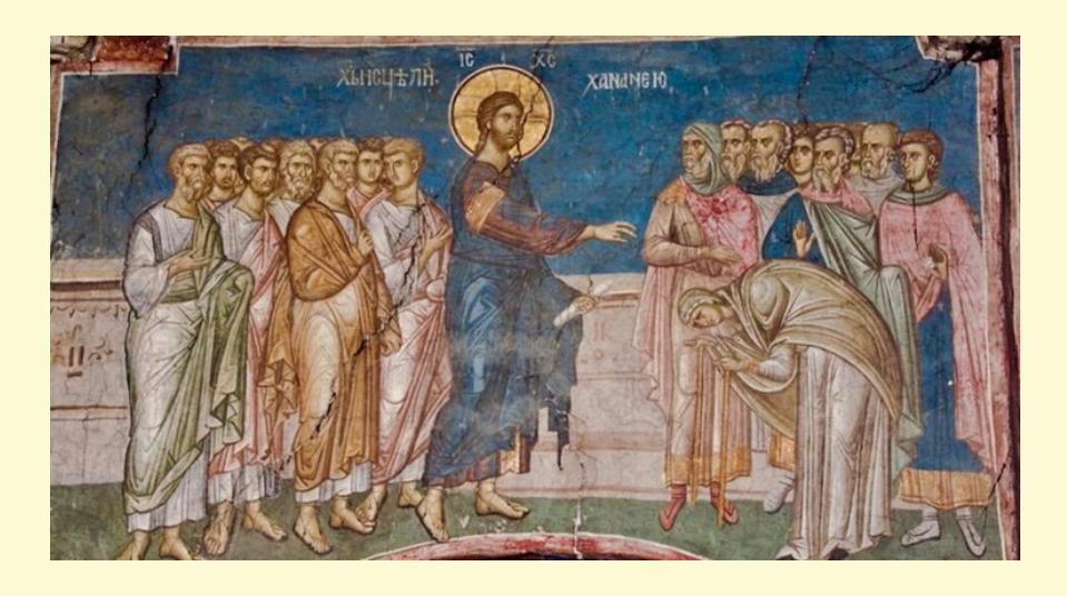
Jesus Heals a Woman on the Sabbath Luke 13:10-17:: Proper 16, Year C

www.standrewskentct.org * 860.927.3486 * st.andrew.kent@snet.net