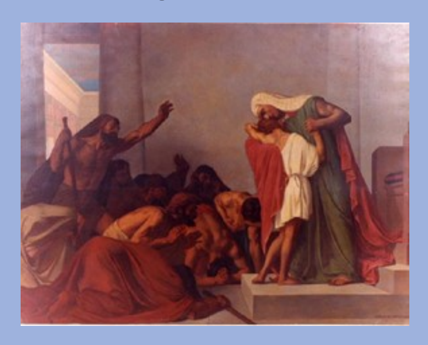
Joseph recognized by his brothers (Genesis 45) (Léon Pierre Urbain Bourgeois, 1863)

www.standrewskentct.org * 860.927.3486 * st.andrew.kent@snet.net