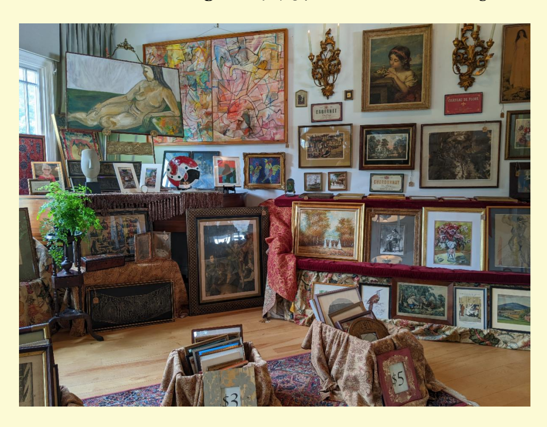
The Tag Sale was a Wild Success!

www.standrewskentct.org * 860.927.3486 *saintandrewskent@gmail.com