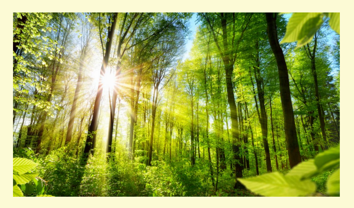
The Third Sunday after Pentecost

www.standrewskentct.org * 860.927.3486 *saintandrewskent@gmail.com