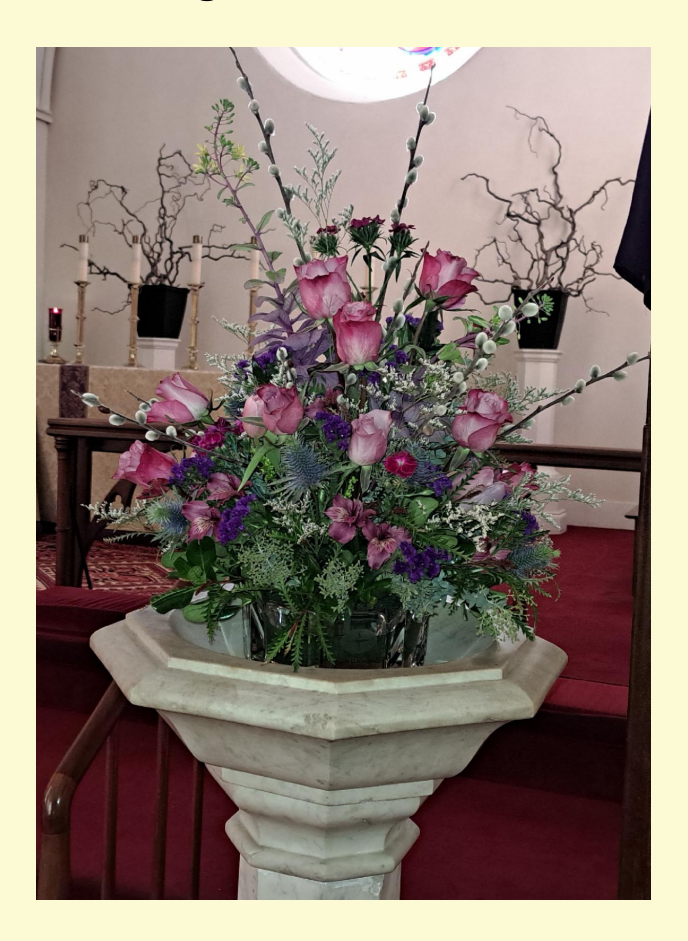
The Fifth Sunday in Lent

www.standrewskentct.org * 860.927.3486 *saintandrewskent@gmail.com