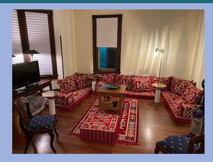
The St Andrew's Refugee Resettlement Team is pleased to share this wonderful news:

They are here! We've met the family, and they were all great, very gracious. They seemed pleased with the house and the town (New Milford), fairly well rested and the children relaxed and at ease.