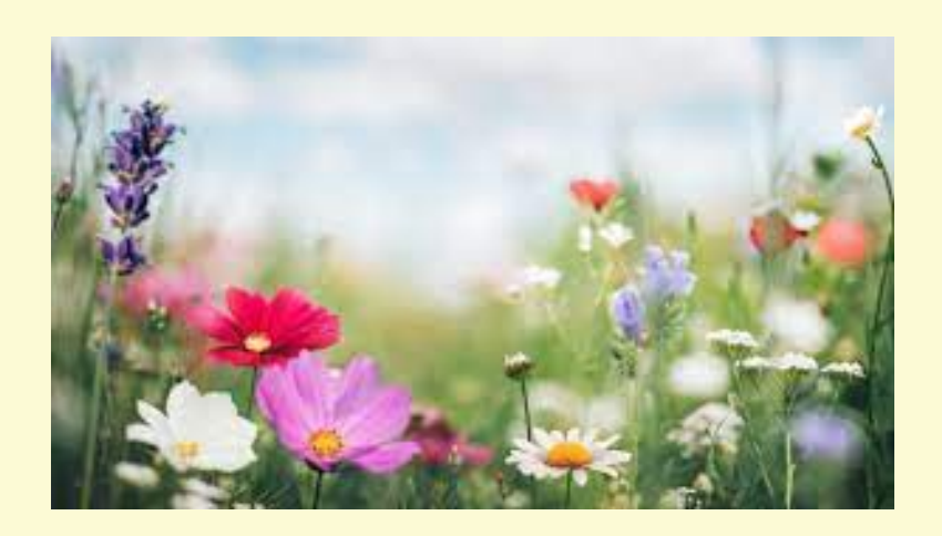
The Second Sunday of Easter

www.standrewskentct.org * 860.927.3486 *saintandrewskent@gmail.com