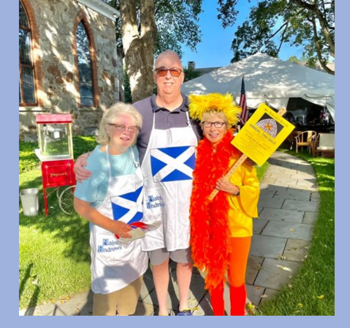
2021 Tag Sale: Our Best Ever!

OK, well, I don't know if I'm technically right in saying this past weekend's Tag Sale was our best ever, but it has to be right up there among the top performers! We raised over $32,000 for the parish capital fund; we had more than 100 early bird shoppers lined up along Main Street when we opened on Friday morning; hundreds more shoppers visited us (some more than once!) over the weekend; and from what I saw, everyone—shoppers and volunteers alike—had a wonderful time contributing to a very good cause. Last week, I said I didn't know quite what to expect. This week, I can say that I can't wait until next year's Sale! I felt like a kid on Christmas morning those three days.