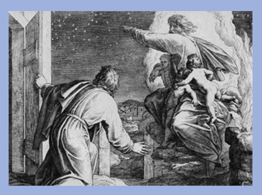
God's Promise to Abram (Genesis 15) (woodcut by Julius Schnorr von Carolsfeld, 1860)

www.standrewskentct.org * 860.927.3486 * st.andrew.kent@snet.net