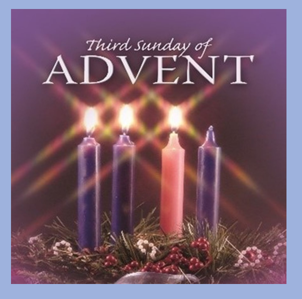
Gaudete Sunday :: Rejoice!

www.standrewskentct.org * 860.927.3486 * st.andrew.kent@snet.net