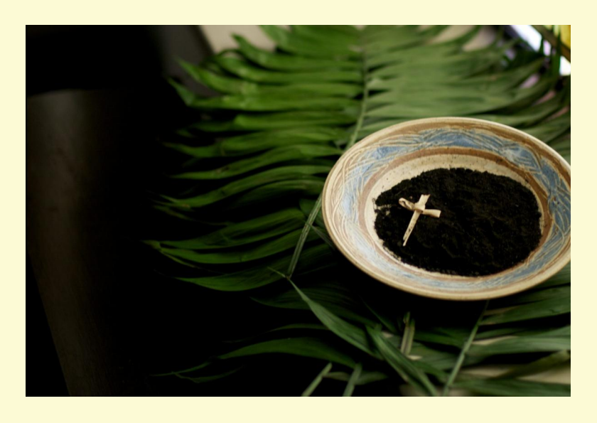
Ash Wednesday is Next Week on February 14th Service at 6:00 pm

www.standrewskentct.org * 860.927.3486 *saintandrewskent@gmail.com