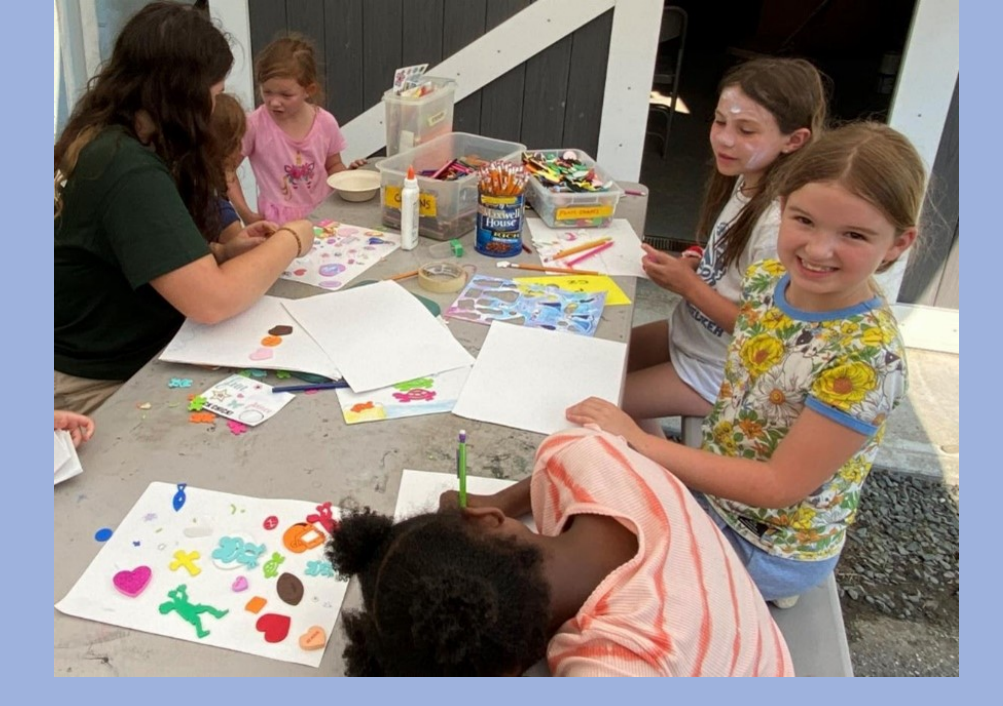
Not quite ready for a full-week camp experience? Check out Mini-Camp at Camp Washington!

Mini Camp is a fun filled program geared towards campers new to overnight camping and who may not be quite ready for a full week camp experience. Join fellow campers in playing fun games, splashing in the water, making crafts, and eating s'mores!