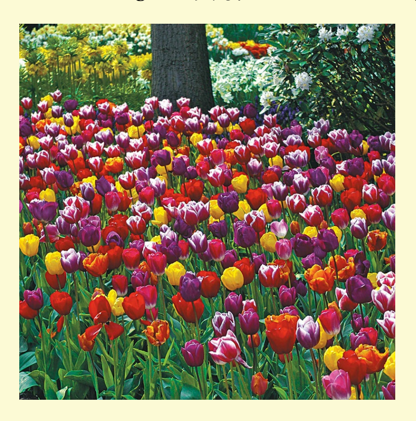
The Fifth Sunday of Easter

www.standrewskentct.org * 860.927.3486 *saintandrewskent@gmail.com