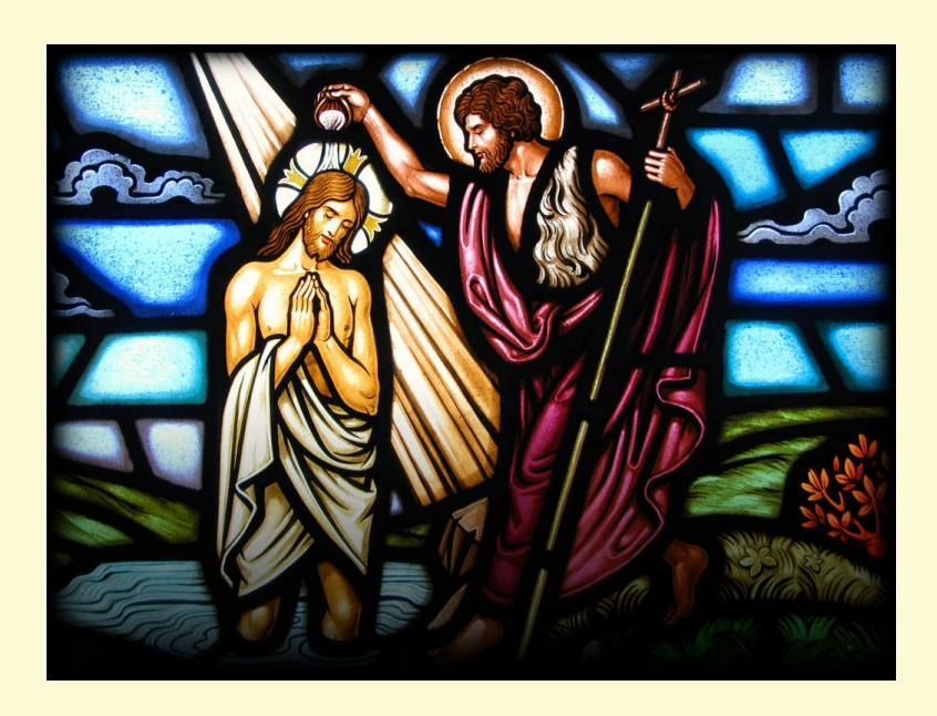
The First Sunday after the Epiphany: The Baptism of Our Lord Jesus Christ

www.standrewskentct.org * 860.927.3486 *saintandrewskent@gmail.com