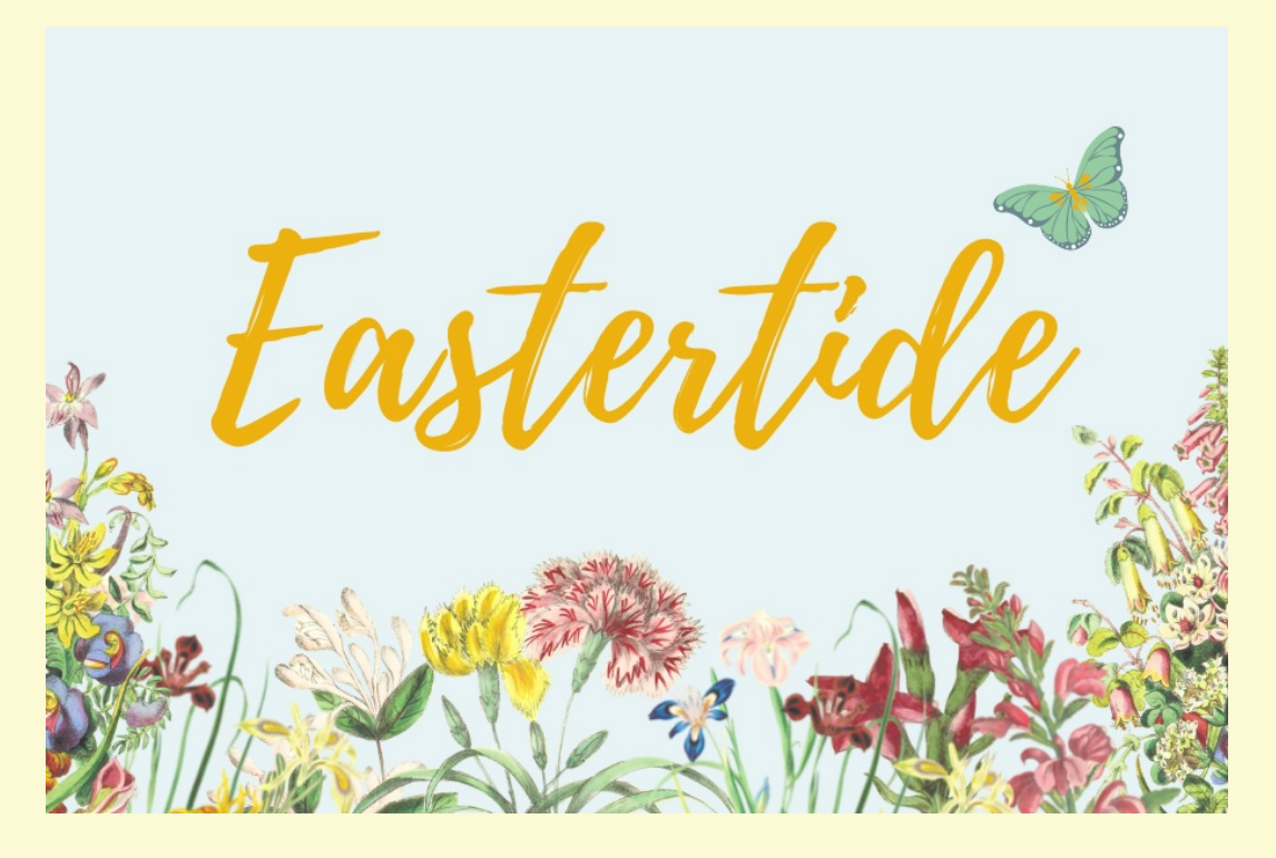
The Second Sunday of Easter

www.standrewskentct.org * 860.927.3486 *saintandrewskent@gmail.com