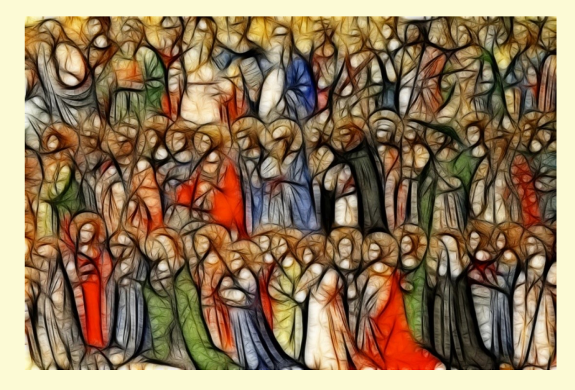
The Feast of All Saints (observed) Year C

www.standrewskentct.org * 860.927.3486 *saintandrewskent@gmail.com