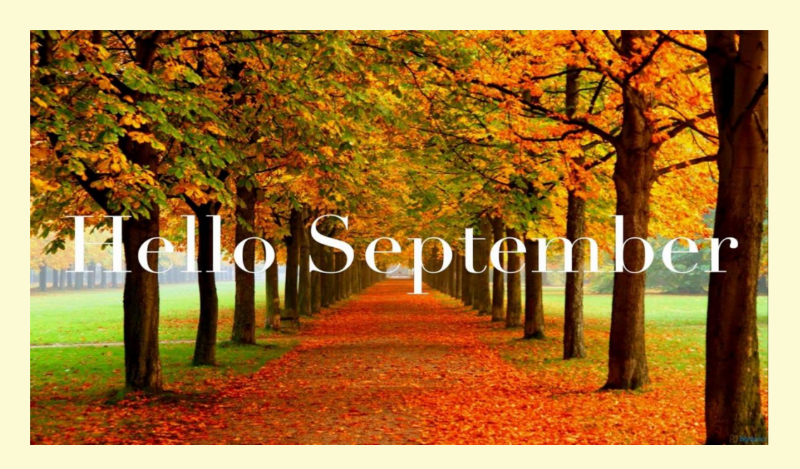
The Fourteenth Sunday after Pentecost

www.standrewskentct.org * 860.927.3486 *saintandrewskent@gmail.com