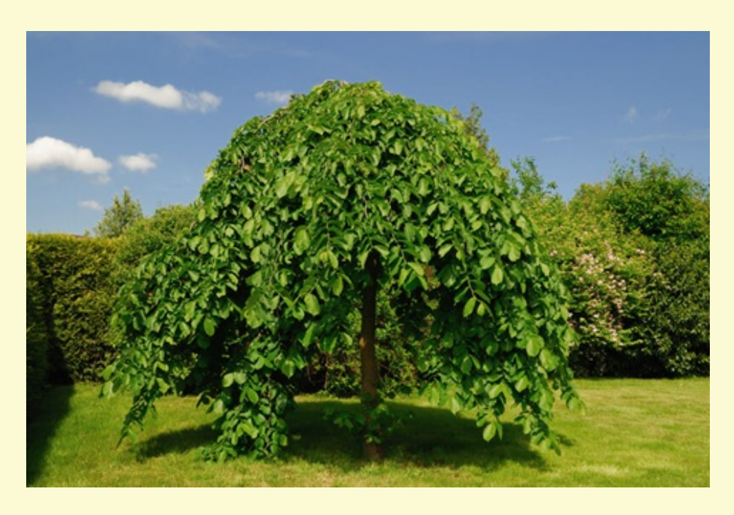
A Mulberry Tree Luke 17:5-10 :: Proper 22, Year C

www.standrewskentct.org * 860.927.3486 *saintandrewskent@gmail.com