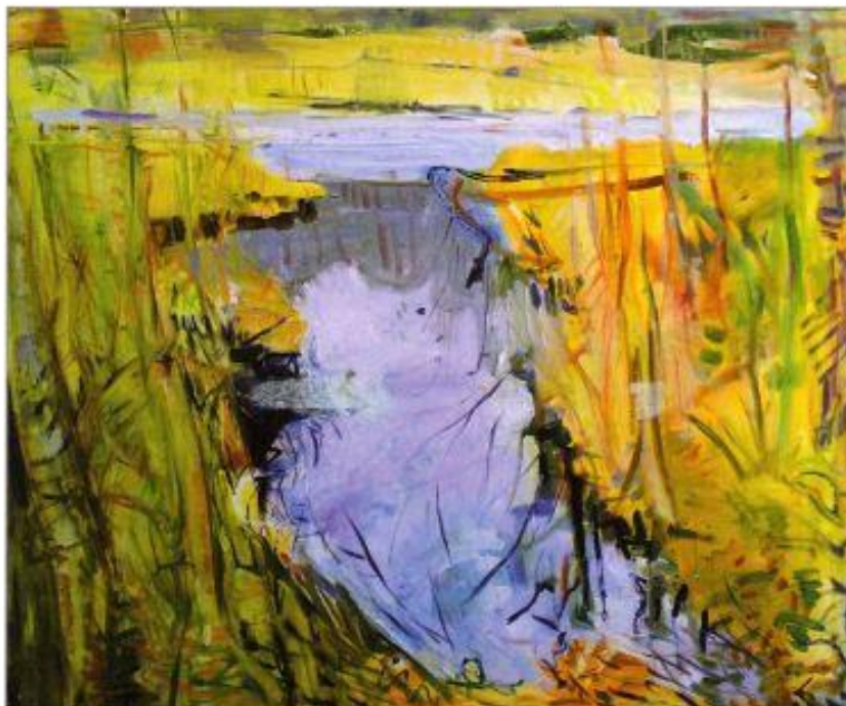
Ash Swamp, New Preston