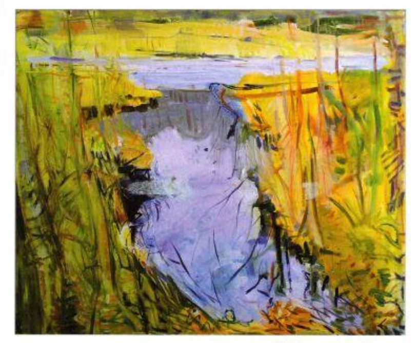
Ash Swamp, New Preston