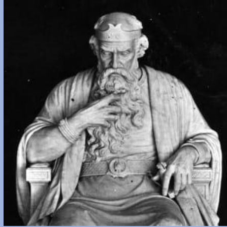
Saul, The First King of Israel

www.standrewskentct.org * 860.927.3486 * st.andrew.kent@snet.net