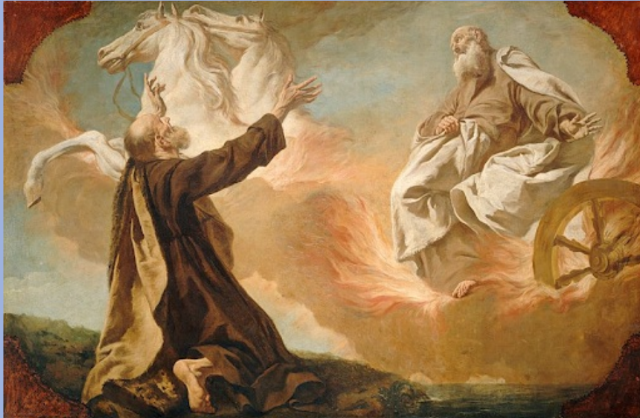
Elijah Taken Up in a Chariot of Fire :: Proper 8, Year C Giuseppe Angeli (c 1740)

www.standrewskentct.org * 860.927.3486 * st.andrew.kent@snet.net