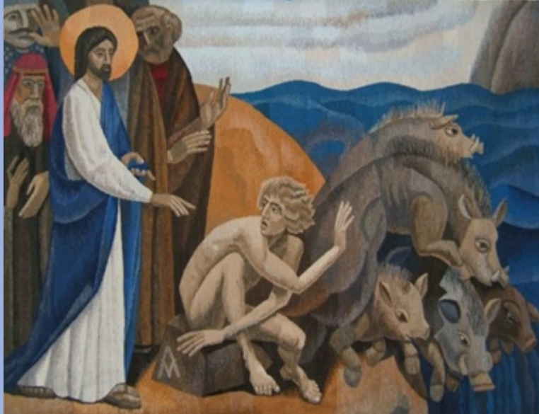
Jesus Casts Out Demons from the Gerasene Man :: Proper 7, Year C

www.standrewskentct.org * 860.927.3486 * st.andrew.kent@snet.net