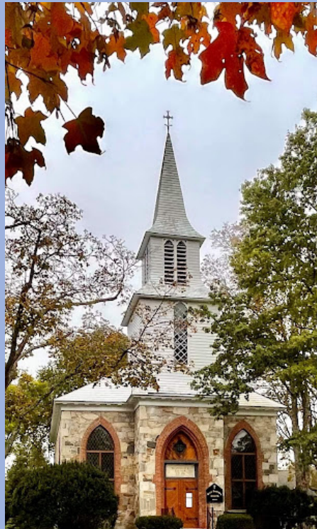
St Andrew's Church in Early Fall

www.standrewskentct.org * 860.927.3486 * st.andrew.kent@snet.net