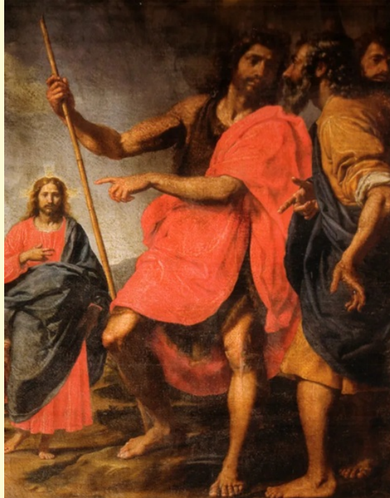
"Behold the Lamb of God": The Second Sunday After the Epiphany (Ottavio Vannini, 1585 - 1643)

www.standrewskentct.org * 860.927.3486 * saintandrewskent@gmail.com