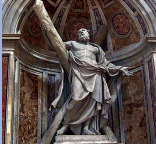
St Andrew (François Duquesnoy, 1629-33)

www.standrewskentct.org * 860.927.3486 * st.andrew.kent@snet.net