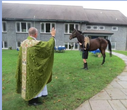
Blessing of the Animals This Past Sunday

www.standrewskentct.org * 860.927.3486 * st.andrew.kent@snet.net