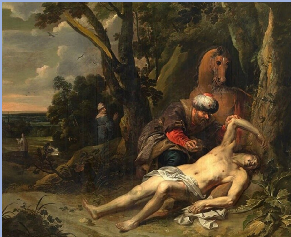
The Parable of the Good Samaritan :: Proper 10, Year C (Balthasar van Cortbemde, 1647)

www.standrewskentct.org * 860.927.3486 * st.andrew.kent@snet.net