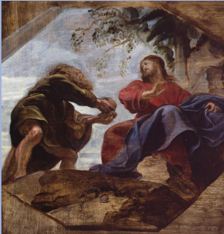
The Temptation of Christ (Luke 4) (Peter Paul Rubens, 1620)

www.standrewskentct.org * 860.927.3486 * st.andrew.kent@snet.net