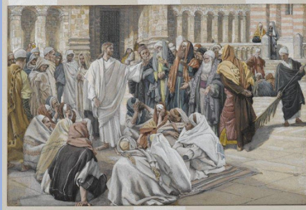
The Pharisees Question Jesus, by James Tissot (1836-1902)

www.standrewskentct.org * 860.927.3486 * st.andrew.kent@snet.net