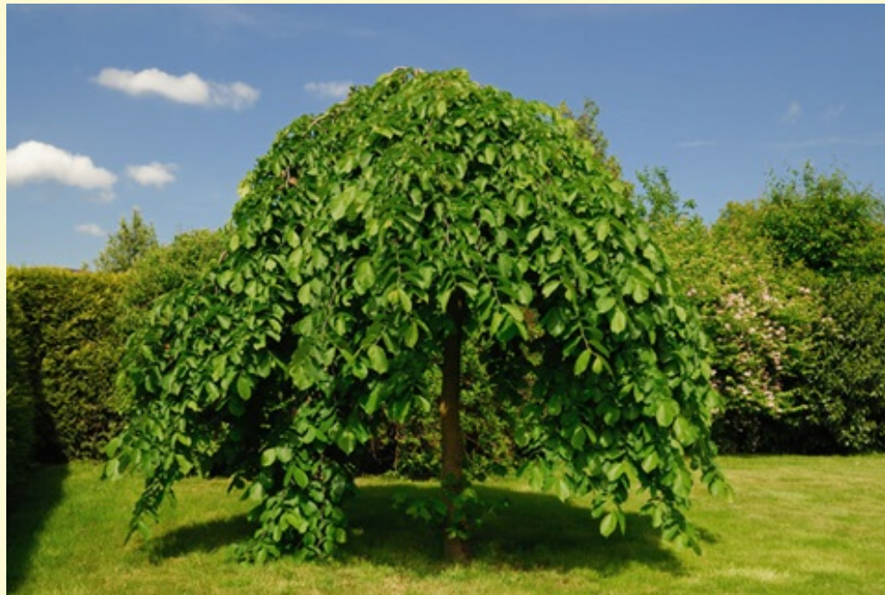
A Mulberry Tree Luke 17:5-10 :: Proper 22, Year C

www.standrewskentct.org * 860.927.3486 * saintandrewskent@gmail.com